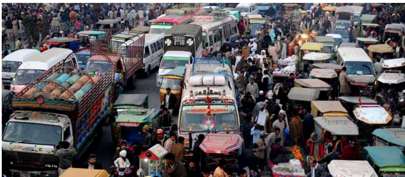
Traffic chaos in Pakistan: The global death risk per mileage travelled is highest for powered two-wheelers, pedestrians or cyclists.

Global traffic safety experts must take large cultural differences into account: in many regions of the world, traffic is not just or not even mainly about cars. Two- and three wheelers of all sorts – powered by small engines or human power – belong to the most common means of transport in many countries. Long distance walking or even having animals in traffic is still a matter of course