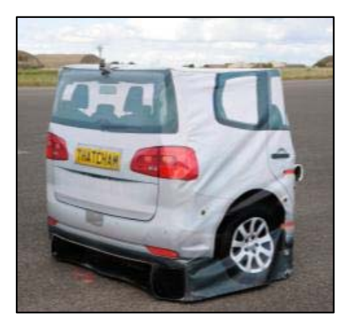
Figure 1 – Euro NCAP Vehicle Target (EVT)

The car target used for the AEB tests shall have the appropriate radar and light reflective and visual signature of that of a real vehicle, equivalent to that of the Euro NCAP Vehicle Target (EVT) as described in Annex A of the Euro NCAP Test Protocol – AEB systems (<u>http://www.euroncap.com/files/AEB-Test-Protocol---v1.0---0-84f3008e-1e2e-4ee5-8e7b-186363aec79c.pdf</u>) as shown in Figure 1.